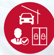
Visitors, Carparks & Storage Lockers