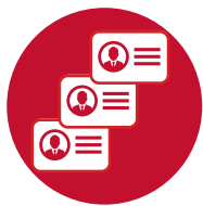
Design & Print Cards