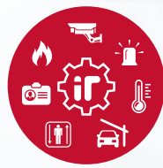
Video Surveillance & Building Integration